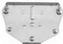
Aluminum – Turbo models