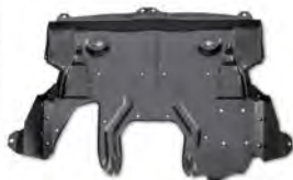
Steel – Non-turbo models